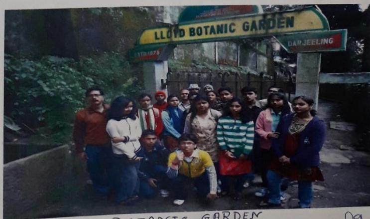
LLOYD BOTANIC GARDEN